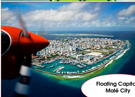
Floating Capital- Malé City