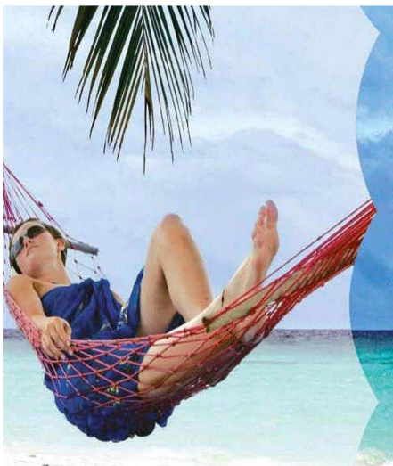
Chaaya LAGOON HAKURAA HURAA