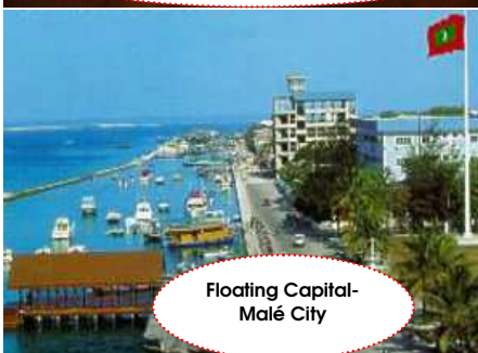
Floating Capital- Malé City